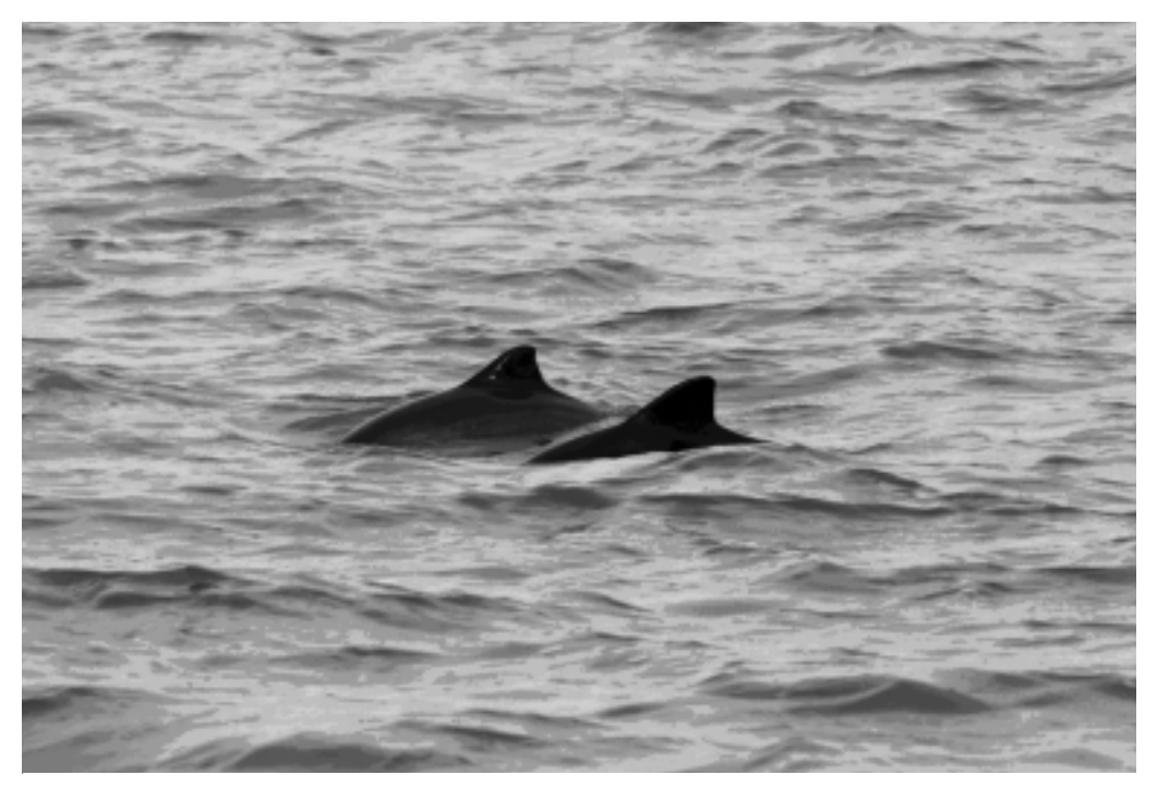
Harbour porpoises, Eemshaven, 21 February 2004.

served in Dutch coastal waters. Shifts in distribution, or immigration, must therefore have been underlying the observed trend.