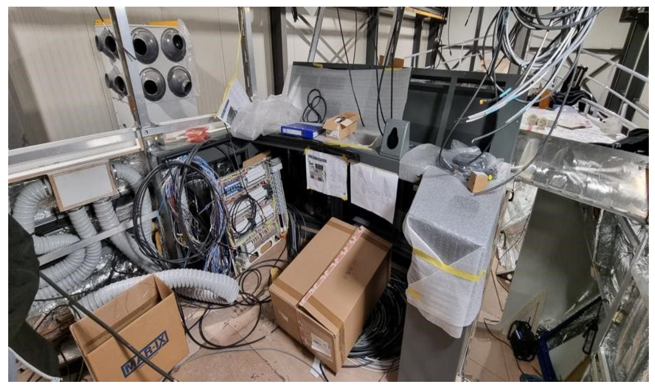
The console for all control, navigation and steering systems, with ducts for the ventilation and heating system to the left.

The command console has been installed in the wheelhouse for all control, navigation and steering systems, so the wheelhouse is nearing completion.