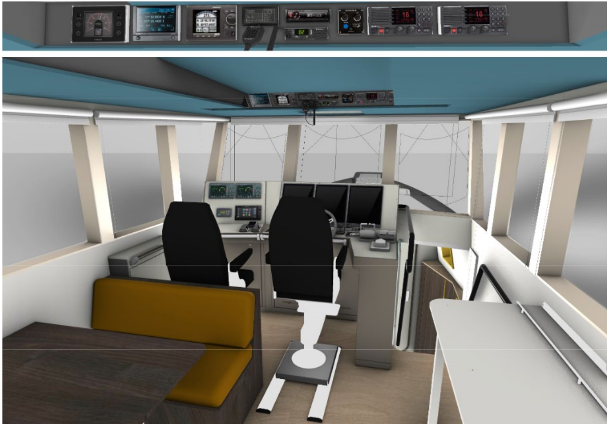
Interior of RV Adriaen Coenen wheelhouse, with view of the bridge and passenger seating (left) and dry lab (right).

The interior design is also complete, with a colour scheme that matches the other two vessels planned for construction.