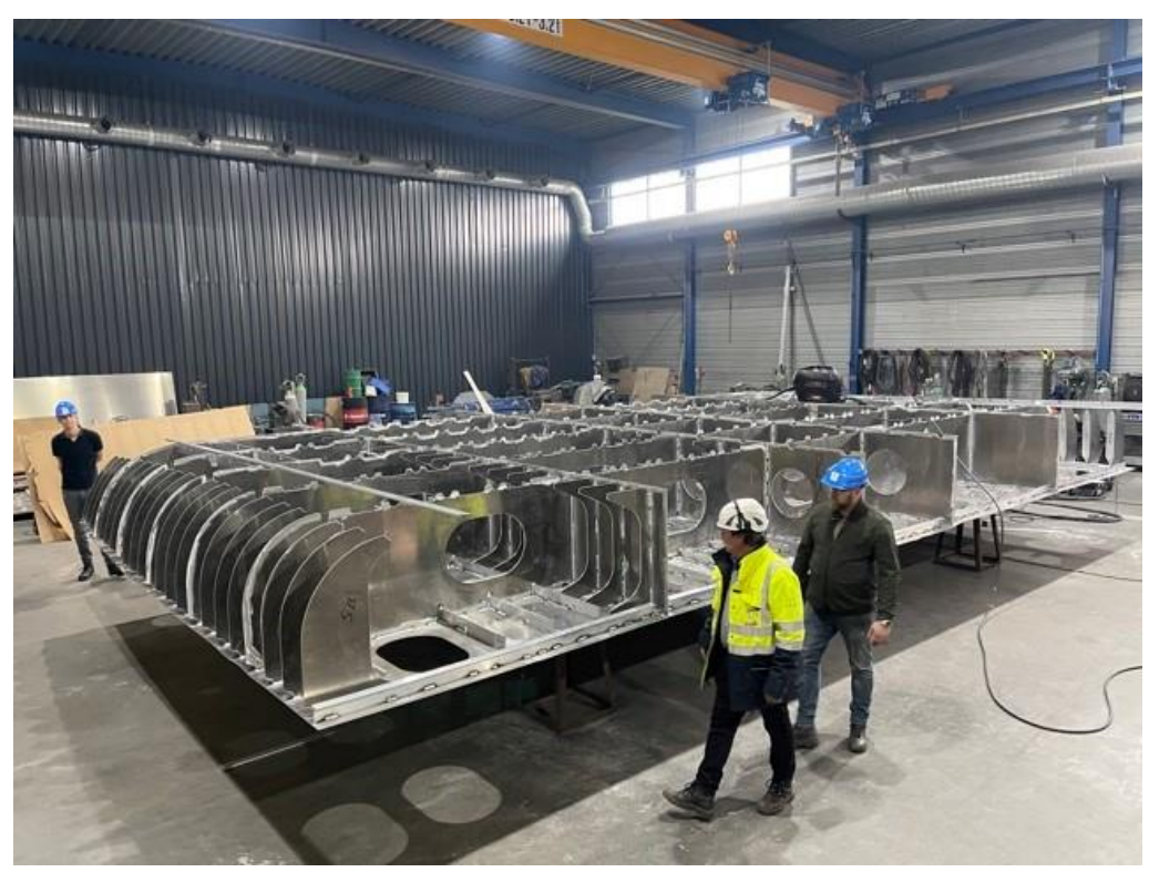
Construction of the first section of the RV Wim Wolff at N. Dijkstra in Harlingen in late October.

The hull will be built in 6-meter sections that are welded together to form the finished vessel. After a slower start-up period, construction on the first section is now in full swing.