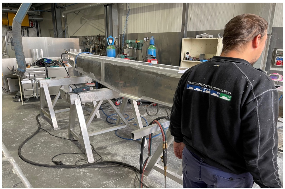
State of affairs in late August. Top: the deck begins to take shape. Bottom: the initial form of the A-frame