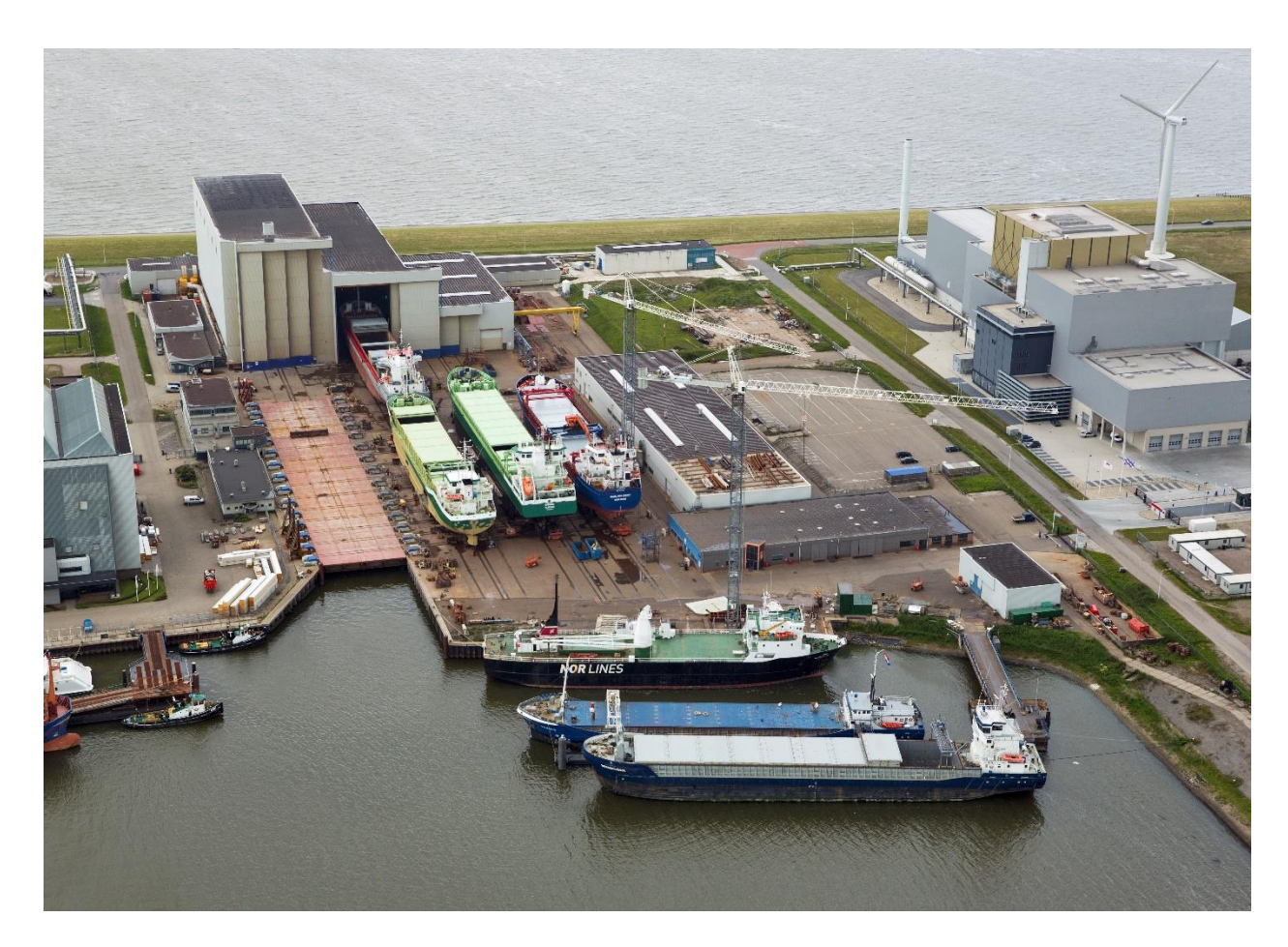
Thecla Bodewes Shipyards in Harlingen, where the construction and fitting out of the RV Wim Wolff will take place.