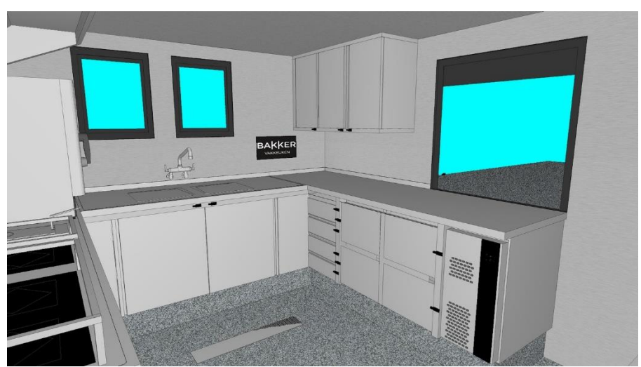
Revised sketch of the galley aboard the RV Wim Wolff. The serving hatch to the messroom is shown to the right.

For more information, please visit: <a href="www.NewResearchFleet.nl">www.NewResearchFleet.nl</a>.