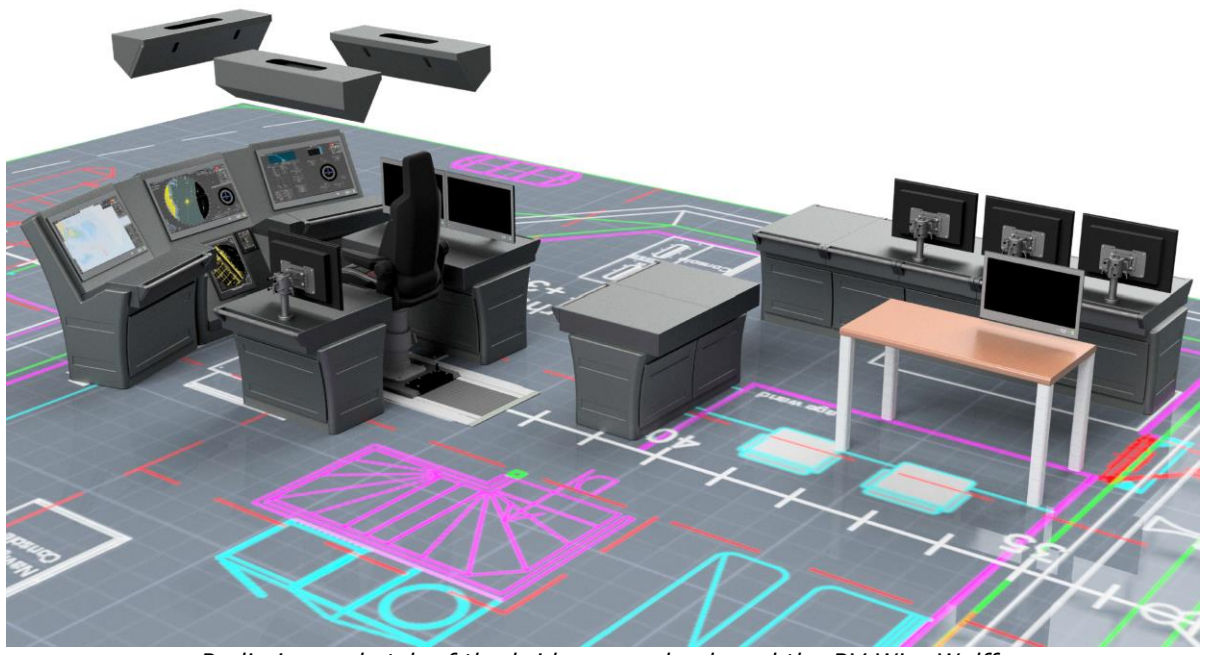
Preliminary sketch of the bridge console aboard the RV Wim Wolff.

Two examples are illustrated below: the bridge and the galley. Preliminary and revised blueprints are already available for both facilities, and every possible detail will be filled in over the next few months.