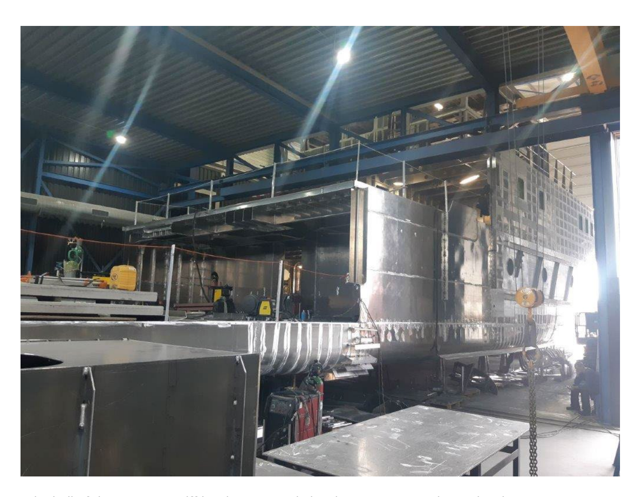
The hull of the RV Wim Wolff has been extended with section 310 and raised with section 270.