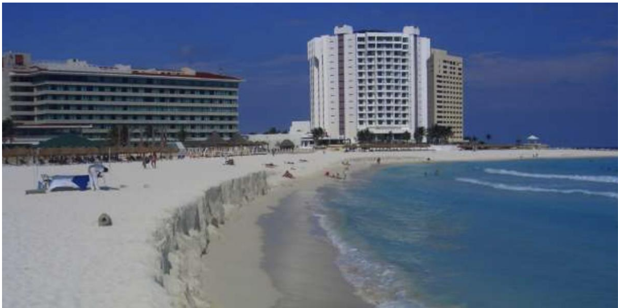
Regular sand nourishments are required on Cancun beach to maintain it, but start eroding immediately.