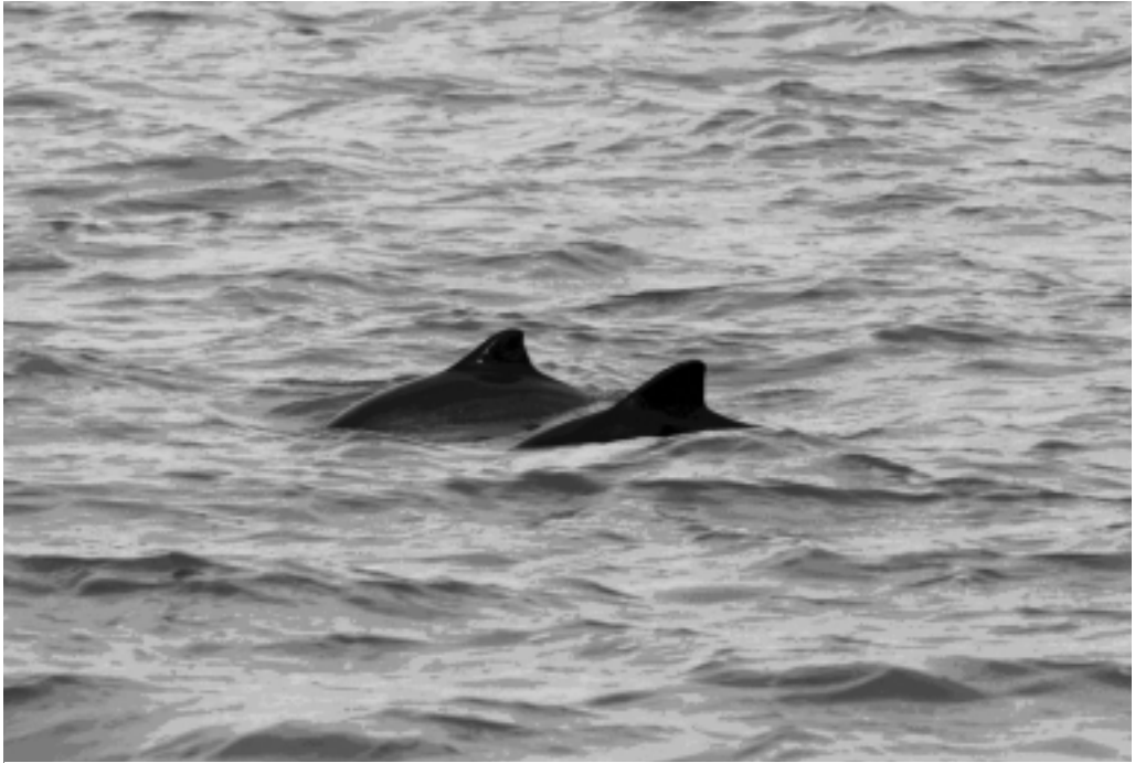
Harbour porpoises, Eemshaven, 21 February 2004.

served in Dutch coastal waters. Shifts in distribution, or immigration, must therefore have been underlying the observed trend.