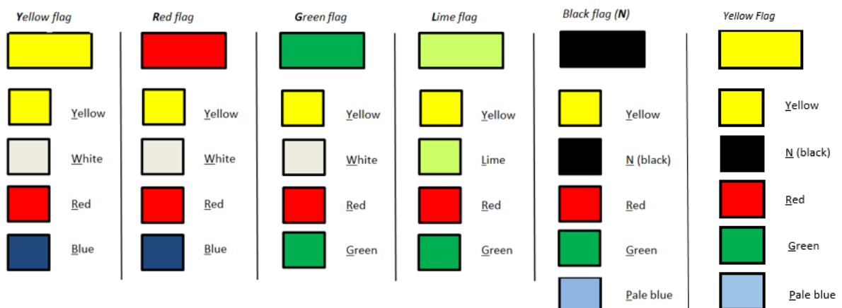
Figure 2 The used color-rings for every flag color, currently we are using yellow flags.