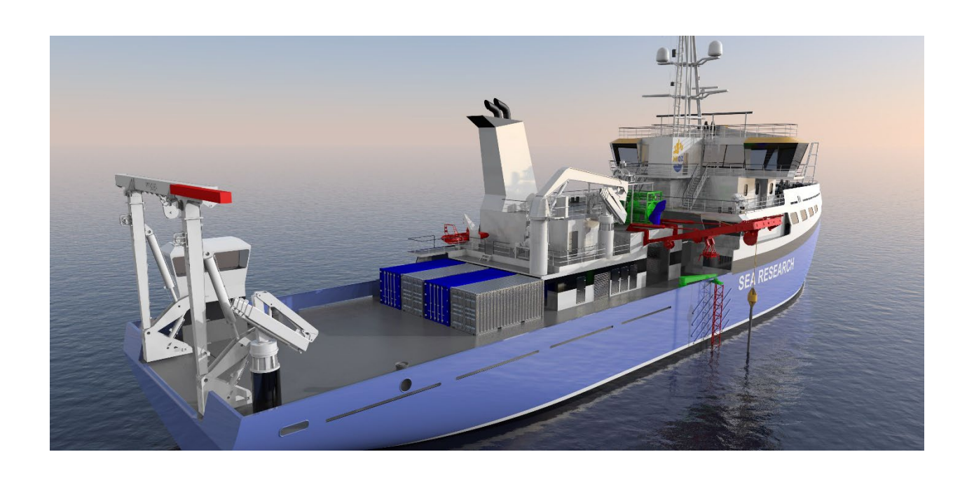
Update #10 December 2023