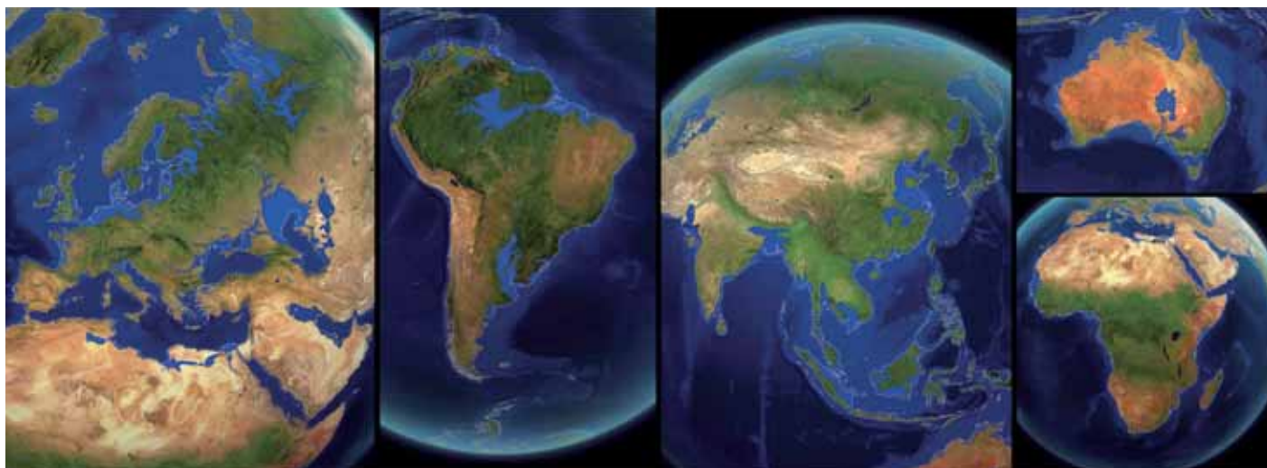
Map demonstrating what the continental coastlines in different regions of the world (left to right, Europe, South America, Southern Asia, Australia and Africa) would look like if all the ice on land melted and drained into the sea, raising the sea level by 68.8 meters.

With this much longer timeframe in mind, Clark et al. stated that the real consequences of unchecked CO 2 emissions will be “large-scale and potentially catastrophic climate change.” The authors also emphasize the magnitude and urgency of the response that is needed. We are presented with a narrow window of opportunity to avoid the worst of these impacts for future generations. The only effective response is to move as rapidly as possible towards the complete decarbonization of the world’s energy systems by targeting net zero or negative carbon emissions.