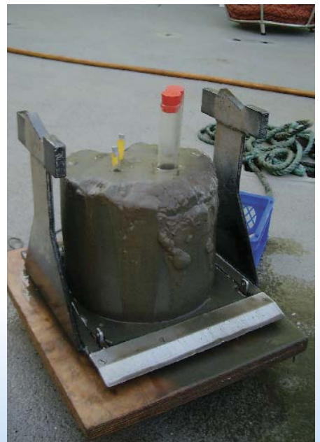
Sediment core collected in the Oyster Ground.

At the species level, there were some clear trends. At the Dogger Bank the small polychaete worm Aricidea minuta was common in the nineties, but the species completely disappeared after 1999. A few years later this sand dwelling species showed a decrease in the southern offshore area too. In the Oyster Ground there was a period