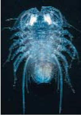
A strange isopod ( Acutiserolis sp.) of 4 cm from 2300 m depth.

In a cooperation between NIWA (National Institute of Water and Atmospheric Research, New Zealand) and NIOZ, 3 cruises with the RV. Tangaroa were carried out in Oct. 2001 and in March and November 2002 to the oceanic Subtropical Front east of New Zealand. The purpose of this multi-annual NIWA project is to study the spatial and temporal variation in the particle export from the front to the deep sea floor and the ways in which this affects the composition and activity of the benthic community. As these frontal zones are considered to act as a strong regional carbon sink in the global carbon cycle, it also serves a global interest to study these systems in much more detail. The study area was east of New Zealand where the STF is topographically fixed by the relatively shallow Chatham Rise (CR). Above the Chatham Rise warm nutrient-poor but Fe-rich subtropical water meets colder nutrient rich, and Fe-poor subantarctic water. The Chatham Rise is an important area of deep-sea fisheries, which is indicative of the high biological production in the overlying waters. Apart from the commercial fish stocks, however, little was known on the sediment and the infauna at the rise and about the influence of the overlying front on biodiversity in general.