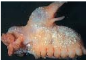
A seacucumber (Elpidiidae) recorded swimming at 3000 m depth.

same zone was found to be covered with an exceptionally thick layer of diatomaceous fluff during the cruise. Such dumps had not been recorded previously and might not be incidental judging from the elevated biomass. Part of the phytodetritus is consumed by the benthic organisms, as we found in animal guts and in the level of sediment oxygen fluxes. However, we observed that tidal currents caused rhythmic resuspension of the fluffy layer (Fig. #) and further transport most likely to much deeper water surrounding CR. Downward transport of the phytodetritus implies a delayed transfer of carbon back to the productive surface layer. The data from the 1 y deployment of the NIOZ landers at 3000 m depth north and south of CR will show whether this transport takes place and the effect it has on the activity of the abyssal sediments.