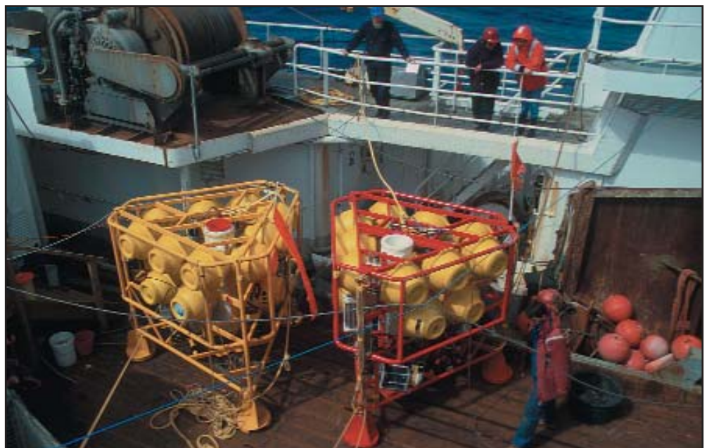
The two ALBEX-landers on board of the RV Tangaroa (NIWA, New Zealand)