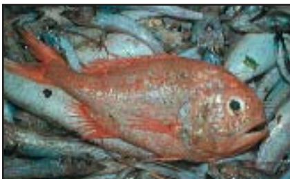
The Orange Roughy, a commercial deep-sea fish in New Zealand waters

The benthic epifauna on the slopes of Chatham Rise was sampled and filmed with a NIOZ video trawl at depths between 350 m and 2800 m the latter being the first records from these large depth. Not surprisingly several species new to the New Zealand fauna were found. Trawling showed an enhanced epifauna biomass on the upper part of the southern slope of CR between 350 and 1200 m depths. The